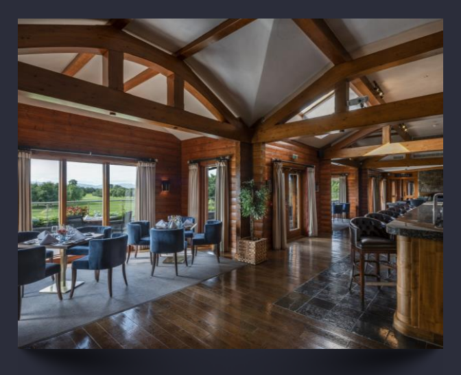
Five Day - €1, 800

7 days a week; access to all competitions and tee-times; full access to locker rooms and members' lounge; designated parking space; discounts on green fees, Pro Shop and bar; and more.