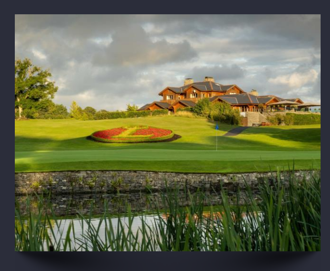
Couples - €5, 400

Mid-week; access to mid-week competitions and tee-times; full access to locker rooms and members' lounge; designated parking space; discounts on green fees, Pro Shop and bar; and more.