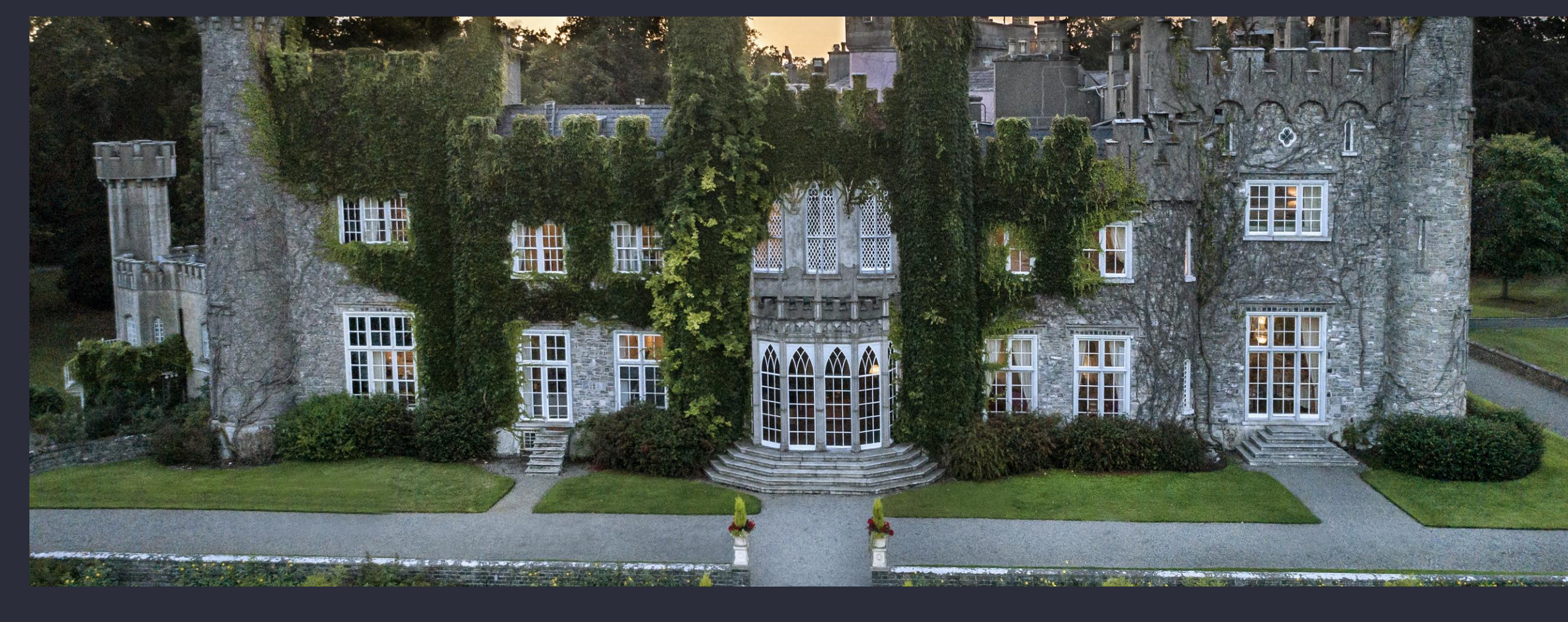
Luttrellstown Castle Resort

Immerse yourself in the enchanting ambiance of our 560-acre estate with a unique and exclusive experience at Luttrellstown Castle Resort. Our venue includes the historic Castle, the charming Gardener's Cottage, and the elegant Salon, all available for your exclusive hire. The Castle boasts two stunning function spaces: the Van Stry Ballroom and the Kentian Room. With 20 individually designed bedrooms within the Castle and an additional 5 bedrooms in the Gardener's Cottage just minutes away, your guests can indulge in comfort and luxury throughout their stay.