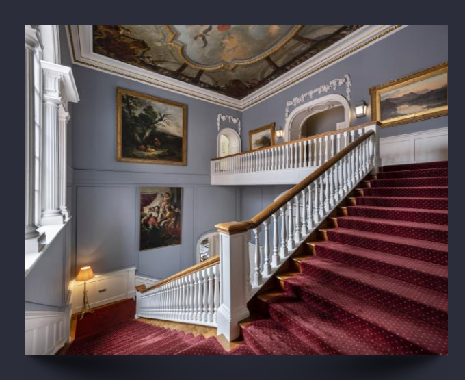
The Inner Hall

Elegant wood finishes inside and picturesque views overlooking the estate outside, make The Library a unique reception space for up to 40 visitors.